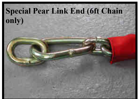
Special Pear Link End (6ft Chain only)

BULLDOG SECURITY PRODUCTS LIMITED Units 1 - 4 Stretton Road, Much Wenlock, Shropshire, TF13 6DH. Tel: 01952 728171 Fax: 01952 728117 Email: sales@bulldogsecure.com Web Site: www.bulldogsecure.com